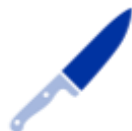
Kitchen and other knives